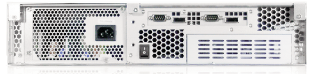
RS8 MS (Mini-SAS)